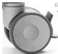
Encapsulated dual wheels.

The ergonomic handle is height-adjustable to enable the caregiver to work more conveniently, comfortably and in an ergonomically correct manner that prevents occupational injuries and minimizes discomfort for those who already have an injury. The smooth surface of the handle is easy to keep clean.