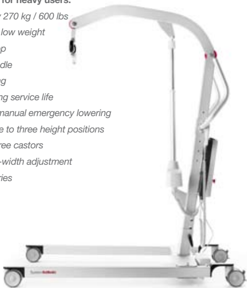
Eva600EE complies with requirements for Class 1-products in the European Medical Device Directive MDD/92/43/EEC.