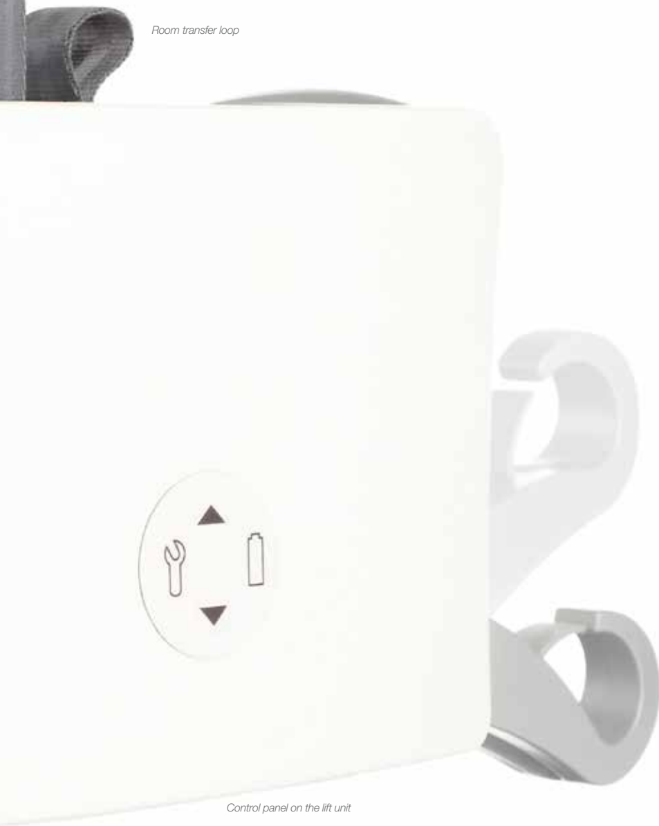
Control panel on the lift unit