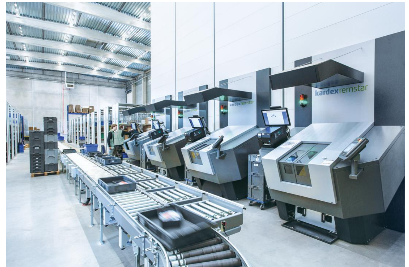
Order picking with turntables and a conveyor system with put locations

Further options and storage environments with air conditioning, fire protection or esd versions are available.