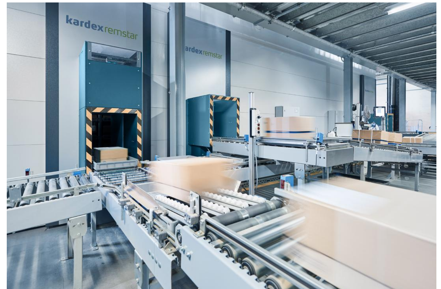
Order consolidation with automatic conveyor connection